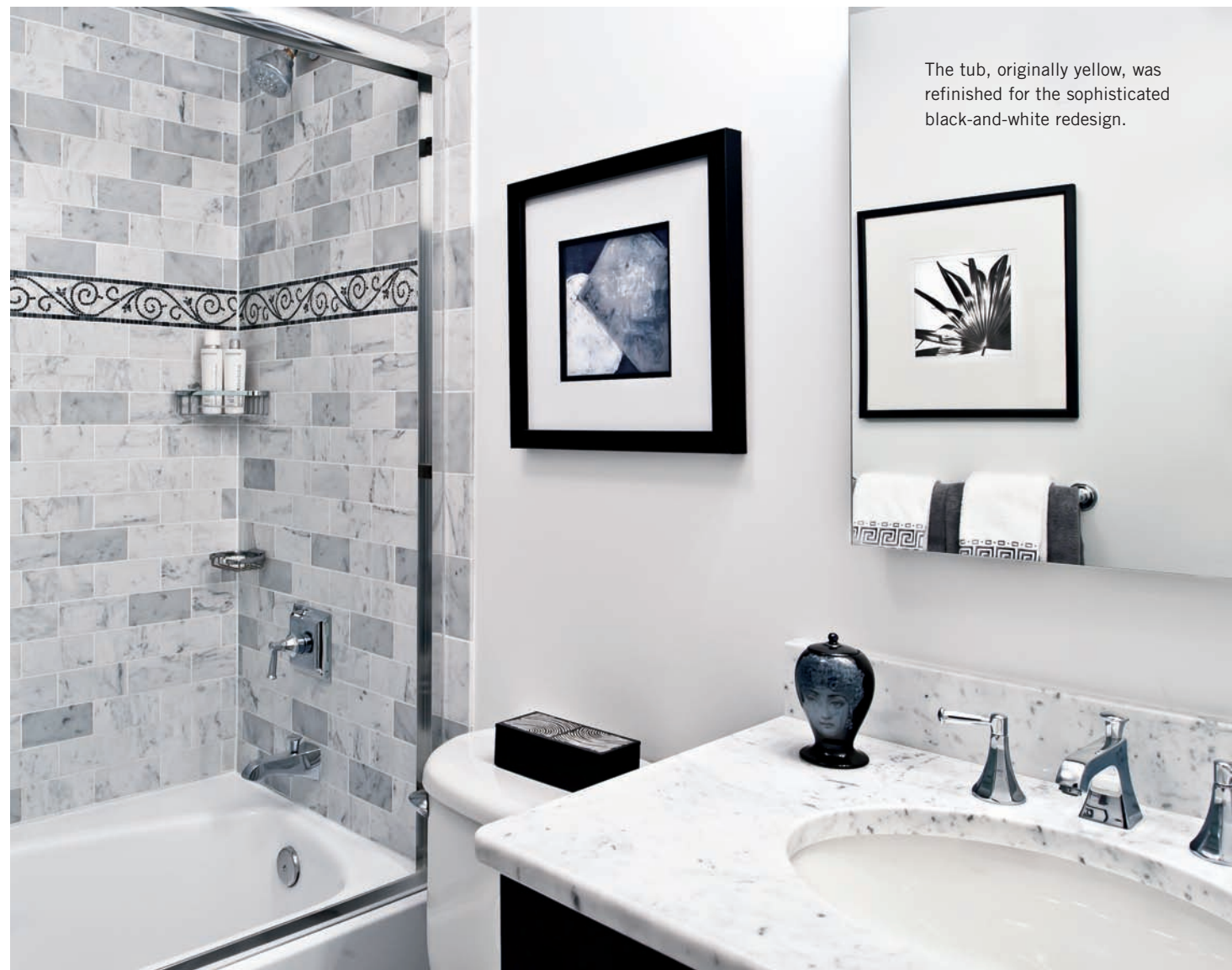
The tub, originally yellow, was refinished for the sophisticated black-and-white redesign.