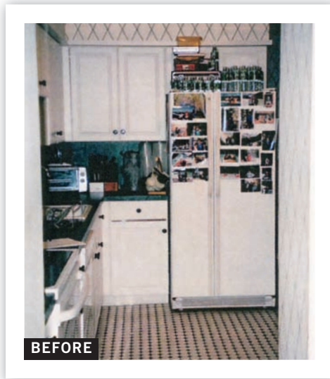
Left: Donleavy and contractor John Bodnar updated the kitchen without changing the cabinetry by replacing the backsplash and countertop. Below: Eye-catching Fornasetti plates give the breakfast bar an interesting view. Donleavy designed the bar's wrought-iron supports; Bodnar had them fabricated.