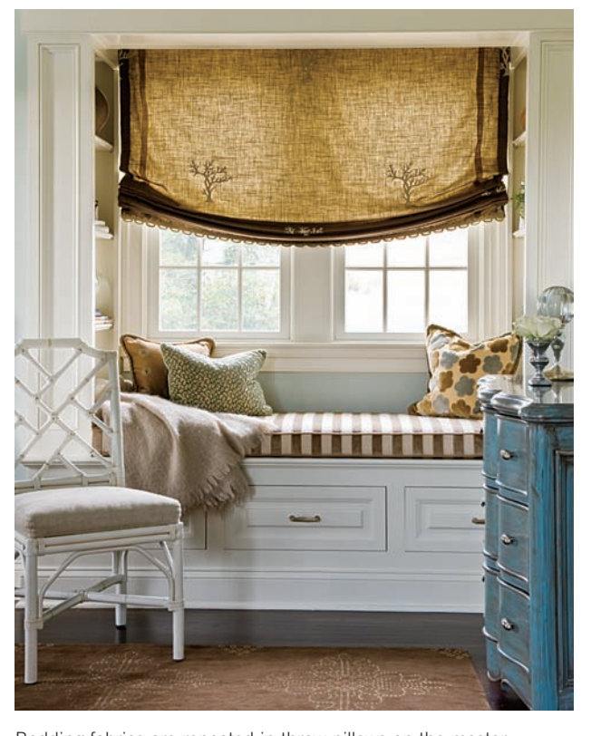
Bedding fabrics are repeated in throw pillows on the master bedroom window seat. Varied patterns in complementary colors form a cohesive whole. Shelves on both sides of the window seat and storage drawers underneath add elegant function.