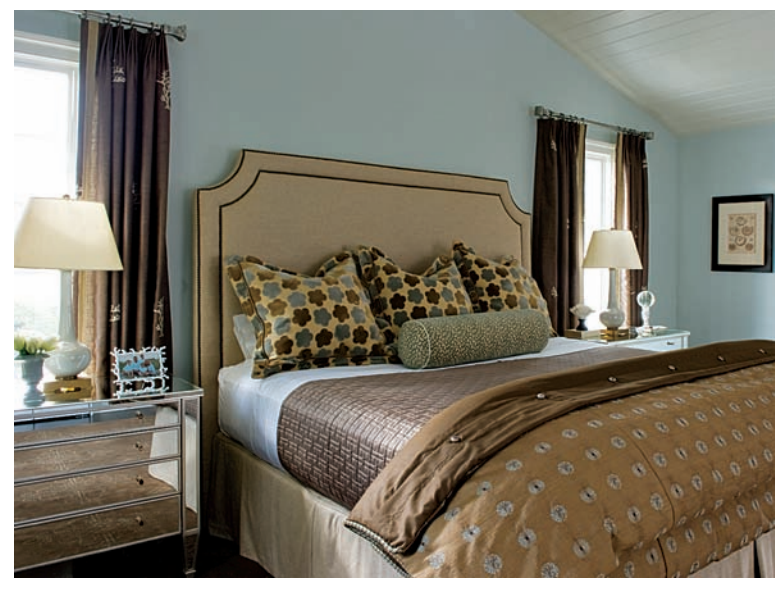
Pale blue/gray and soft beige in the master bedroom are a gentle, restful reimagining of sand, surf, and sky. "I love the colors," the wife says. "That was what we started the design process with. With its high ceilings, it feels so big and open."

Top: "The kitchen is small, yet functional," the homeowner says. White-painted maple cabinetry and soft gray granite countertops and backsplash tile offer practicality and create a light, spacious ambience. Glass doors on the upper cabinetry open the space visually. The beige and brown window treatment complements the serene color scheme without disrupting it. Bottom: A smiling octopus watches over the breakfast area. Black seating and throw pillows provide a sharp contrast to the white cabinetry and bead-board wainscoting. This is where family game time happens. "Usually there is a puzzle there in the making," the homeowner says.